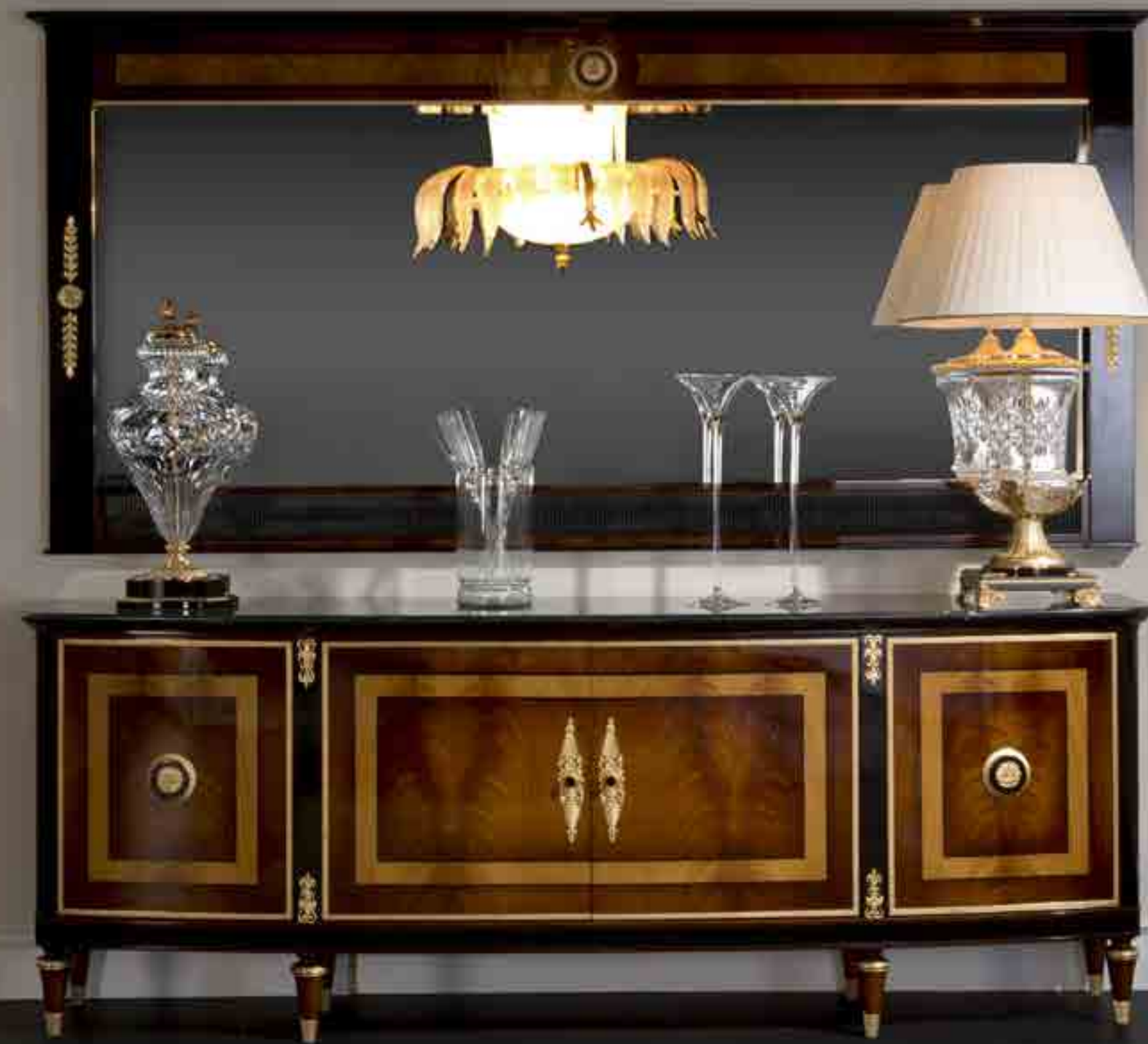
Aparador/Sideboard - Ref.: 50223 88 ↑ 240 ↔ 56 ↓ cm/34,65" ↑ 94,49" ↔ 22,05" ↓ Acabado/Finish: CAMD.B./OA (523/231) Tapa superior mármol/Marble Top Cover Peso Neto/Net Weight: 168,00Kg/370,04Lb