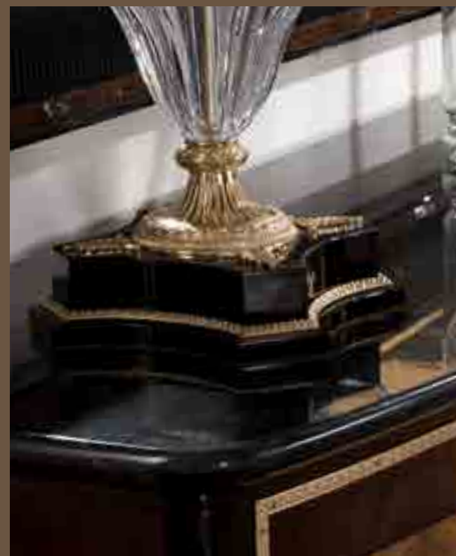
Ref.: 50223-0 Tapa superior de mármol / marble top