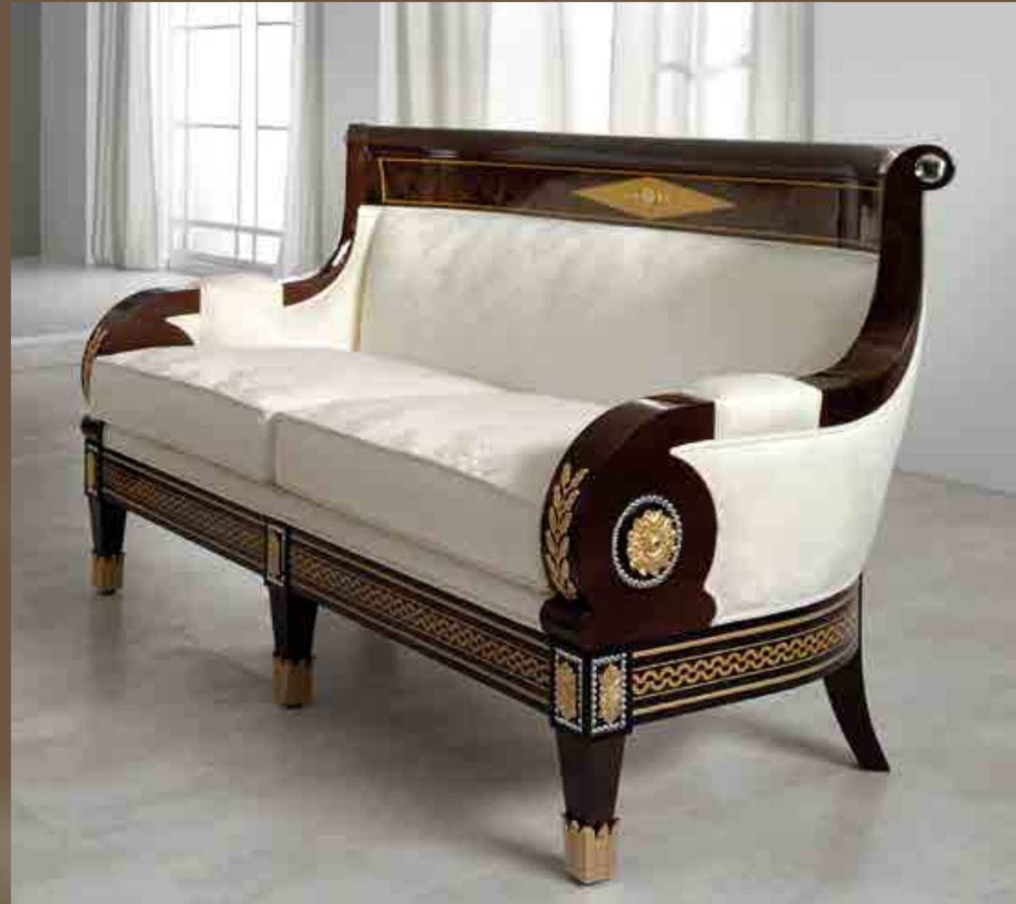
Sofá 2 PL./Sofa 2 Seater - Ref.: 2379_2 - 99|172↔96,7cm/38,98" | 67,72" ↔ 37,80" ↗ Acabado/Finish: NO/OA (19/231) - Peso neto/Net Weight: 67,00Kg/147,58Lb