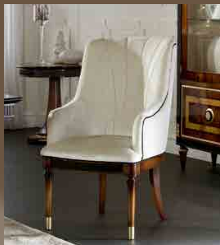
Sillón / Armchair – Ref.: 50227 105 ↑ 60 ↔ 65 ↓ cm / 41,34" ↑ 23,62" ↔ 25,59" ↓ Acabado/Finish: CAMD.B./OA (523/231) Peso Neto/Net Weight: 15,00Kg/33,04Lb