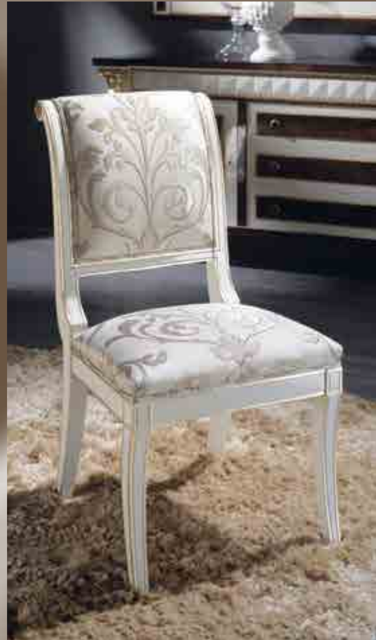
Silla/Chair - Ref.: 50034 - 98 ↑ 47 ↔ 62 ↓ cm - 38,58" ↑ 18,50" ↔ 24,41" ↓ Acabado/Finish: BEL/OF (488/55) - Peso neto/Net Weight: 10,00Kg/22,03lb