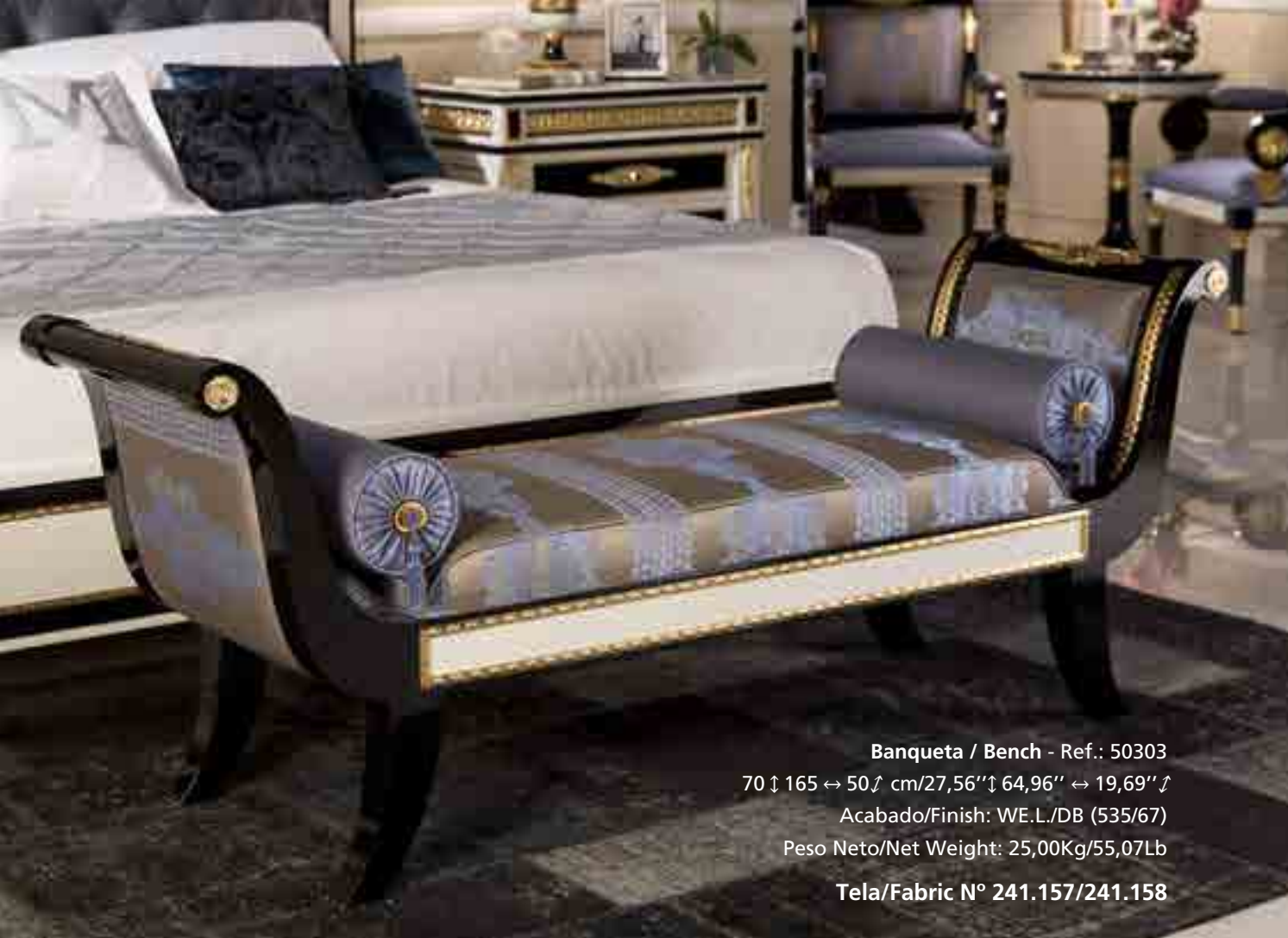
Banqueta / Bench - Ref.: 50303 70 ↓ 165 ↔ 50 ↑ cm/27,56" ↓ 64,96" ↔ 19,69" ↑ Acabado/Finish: WE.L./DB (535/67) Peso Neto/Net Weight: 25,00Kg/55,07Lb Tela/Fabric N° 241.157/241.158