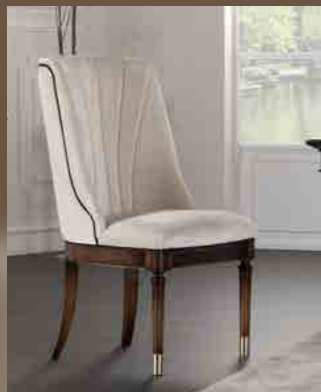
Silla / Chair Ref.: 50226 -105 ↑ 60 ↔ 65 ↓ cm / 41,34" ↑ 23,62" ↔ 25,59" ↓ Acabado/Finish: CAMD.B./OA (523/231) Peso Neto/Net Weight: 12,00Kg/26,43Lb