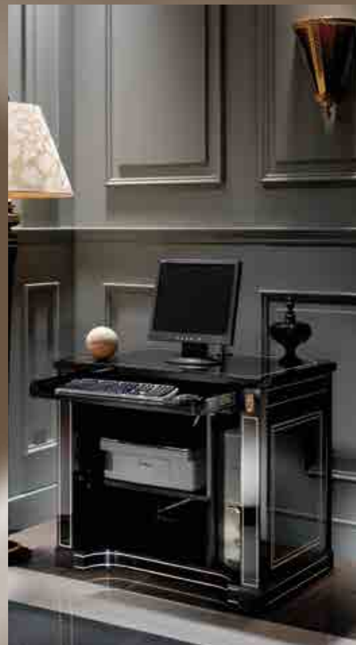
Mueble PC/PC Desk - Ref.: 2421 81↑96↔64↗cm/31,89"↑37,80"↔25,20" ↗ Acabado/Finish: N/DB (66/67) Peso neto/Net Weight: 50,00Kg/110,13Lb