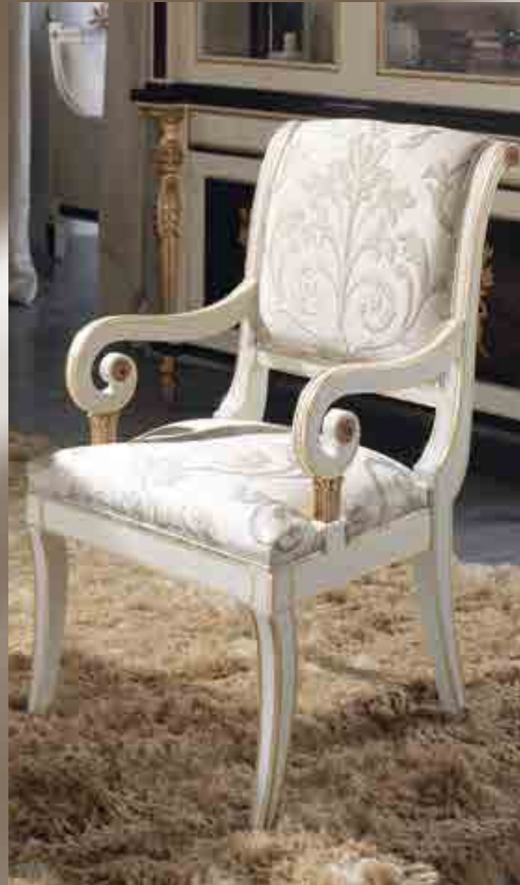
Tela Nula/Discontinued Fabric Tela Sugerida/Suggested Fabric N°241.108