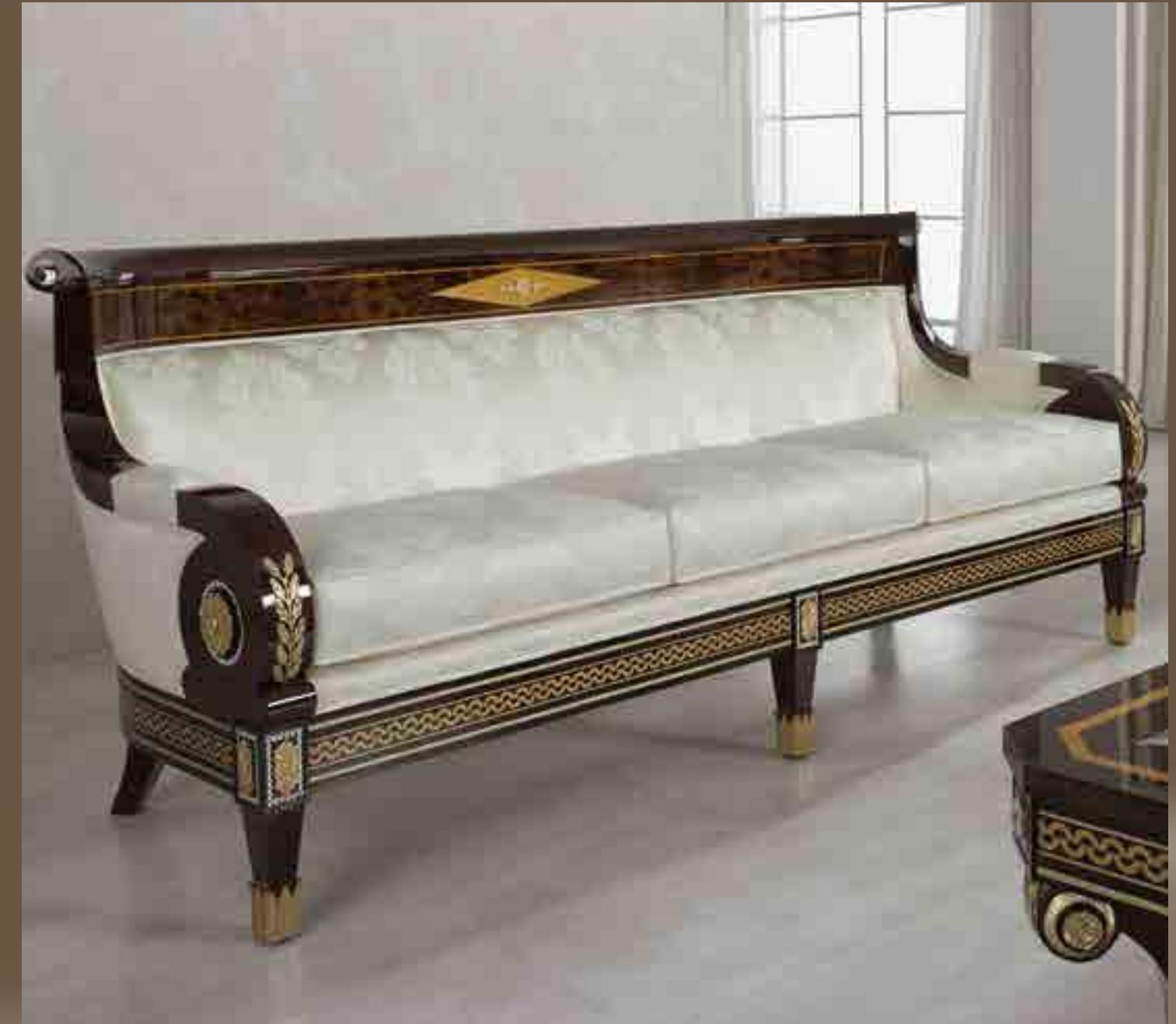
Sofá 3 PL./Sofa 3 Seater - Ref.: 2378_2 - 99|230↔96,7cm/38,98" | 90,55" ↔ 37,80" ↗ Acabado/Finish: NO/OA (19/231) - Peso neto/Net Weight: 78,00Kg/171,81Lb