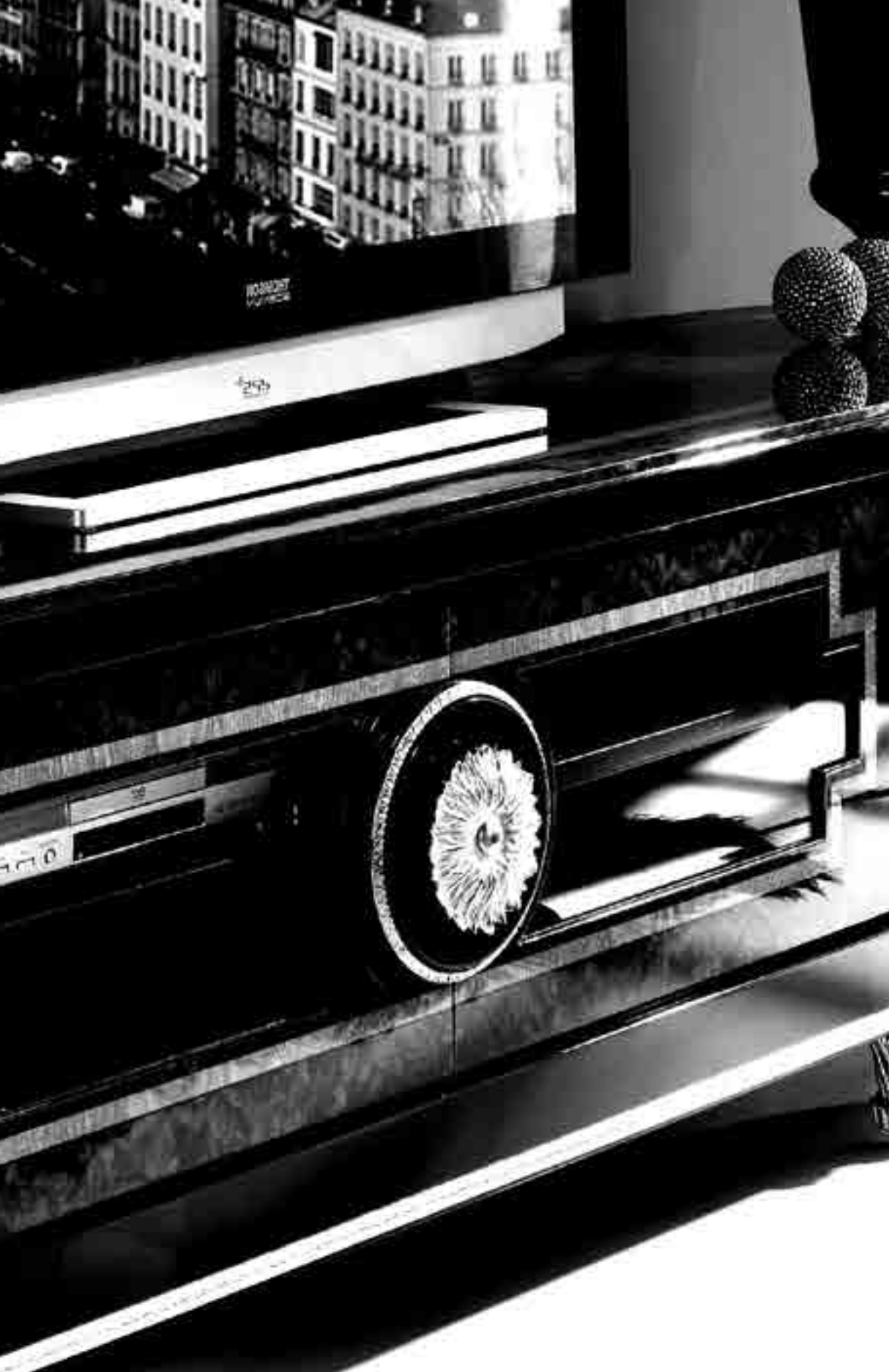
Mueble TV/TV Furniture - Ref.: 50152 60 ↓ 231 ↔ 50 ↑ cm - 23,62" ↓ 90,94" ↔ 19,69" ↑ Acabado/Finish: NO.POE/OA (435/231) Peso Neto/ Net Weight: 145,00Kg/319,38Lb