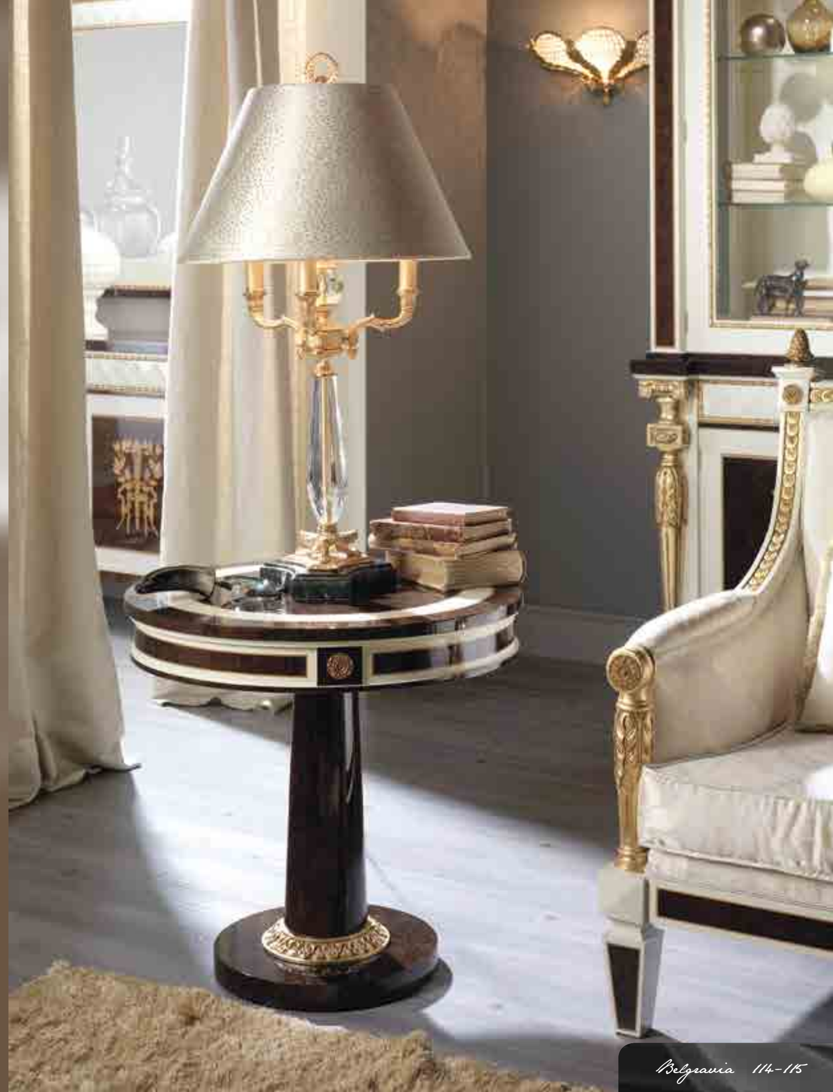
Velador/Side Table Ref.: 50040 65 ↑ 68 Ø cm 25,59" ↑ 26,77" Ø Acabado/Finish: BEL/OF (488/55) Peso neto/Net Weight: 20,00Kg/44,05lb