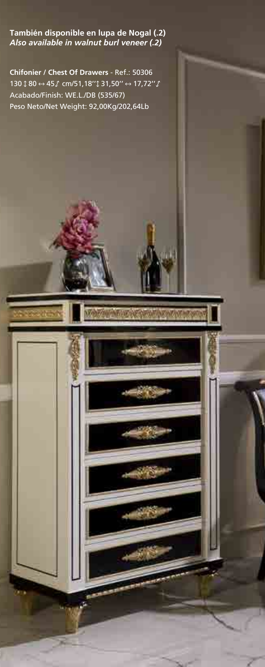
También disponible en lupa de Nogal (.2) Also available in walnut burl veneer (.2) Chifonier / Chest Of Drawers - Ref.: 50306 130 ↑ 80 ↔ 45 ↗ cm/51,18" ↑ 31,50" ↔ 17,72" ↗ Acabado/Finish: WE.L./DB (535/67) Peso Neto/Net Weight: 92,00Kg/202,64Lb