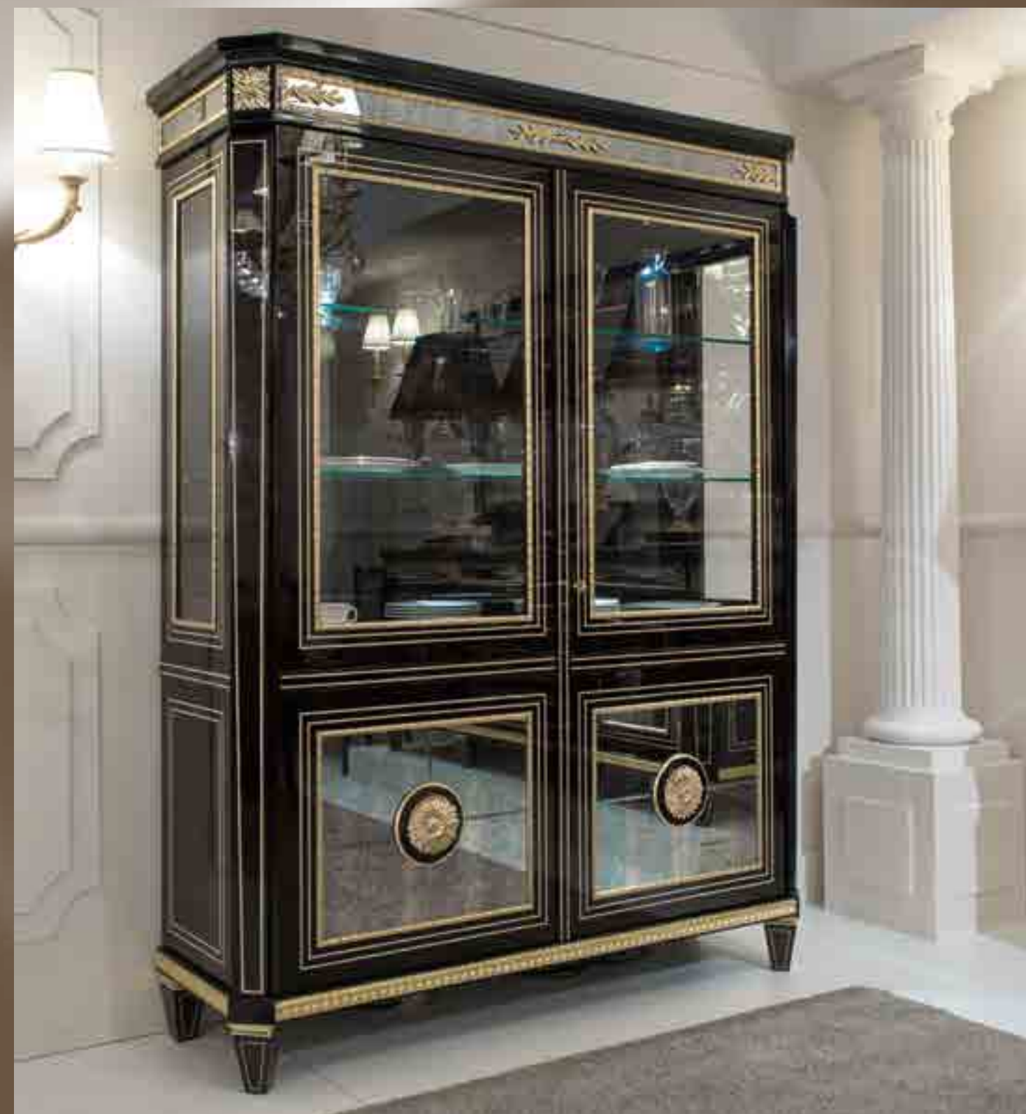
Vitrina/Cabinet - Ref.: 50090 215 ↑ 165 ↔ 50,7cm - 84,65" ↑ 64,96" ↔ 19,69" Acabado/Finish: N.A.B./DB (515/67) - Peso neto/Net Weight: 186,00Kg/409,69Lb

Tela Nula / Discontinued Fabric Tela Sugerida/Suggested Fabric N° 243.012