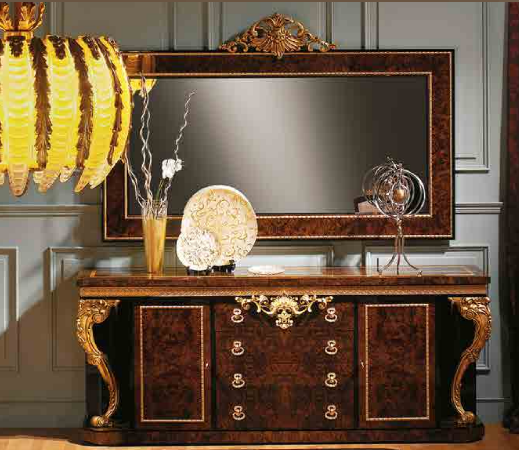
Aparador/Sideboard - Ref.: 2406 96↑ 235↔ 48↓ cm/37,80"↑ 92,52"↔ 18,90"↓ Acabado/Finish: NO.POE/OA (435/231) Peso neto/Net Weight: 169,00Kg/372,25lb