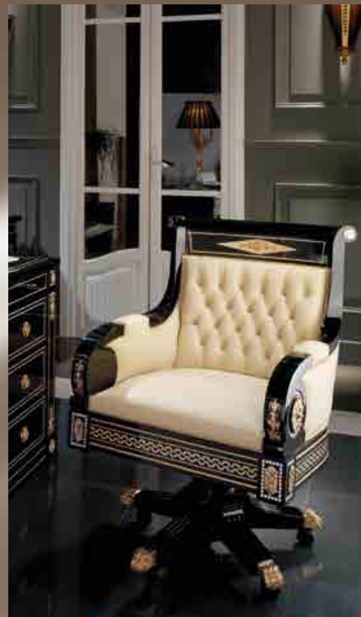
Sillón Giratorio/Armchair - Ref.: 2420 116↑70↔83↗cm/45,67"↑27,56"↔32,68" ↗ Acabado/Finish: N/DB (66/67) Peso neto/Net Weight: 45,00Kg/99,12Lb