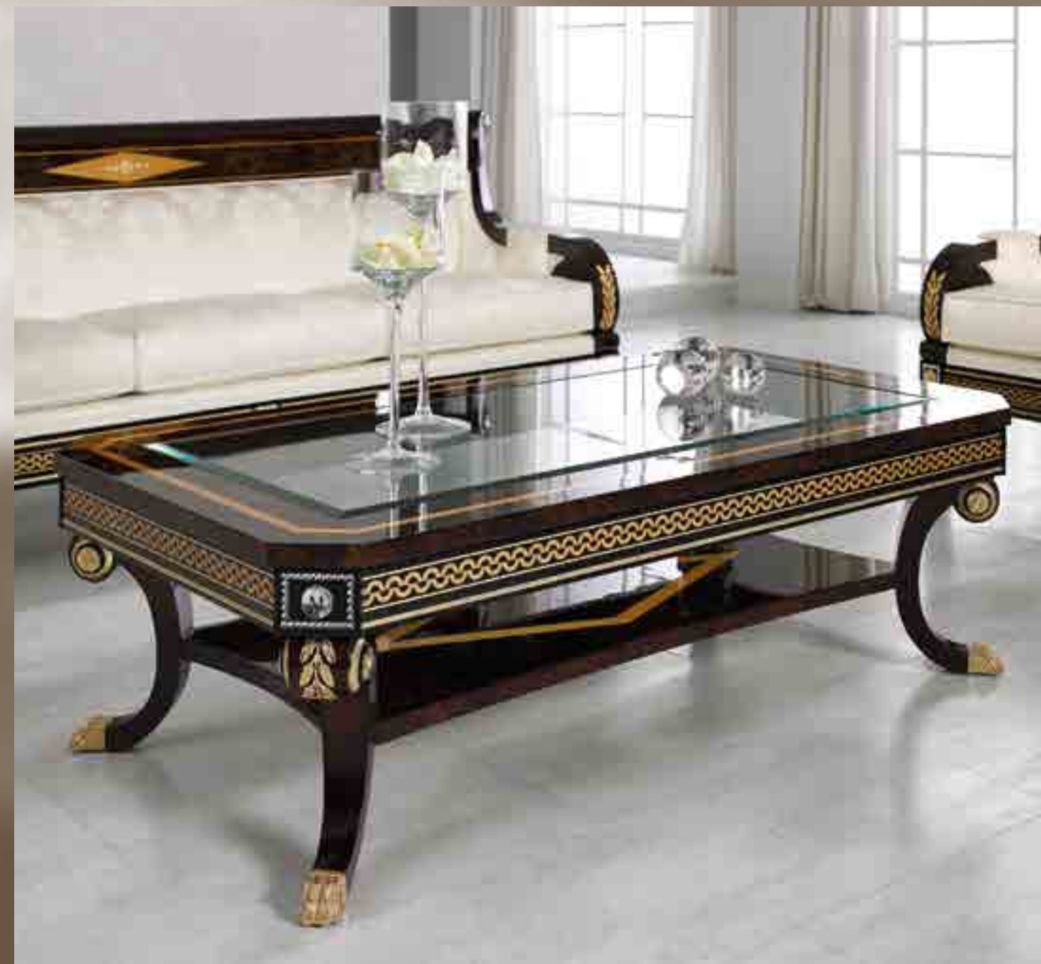
Mesa Centro/Coffee Table - Ref.: 2370_2 49↑ 157↔ 92↓cm - 19,29"↑ 61,81"↔ 36,22"↓ Acabado/Finish: NO/OA (19/231) - Peso neto/Net Weight: 65,00Kg/143,17Lb