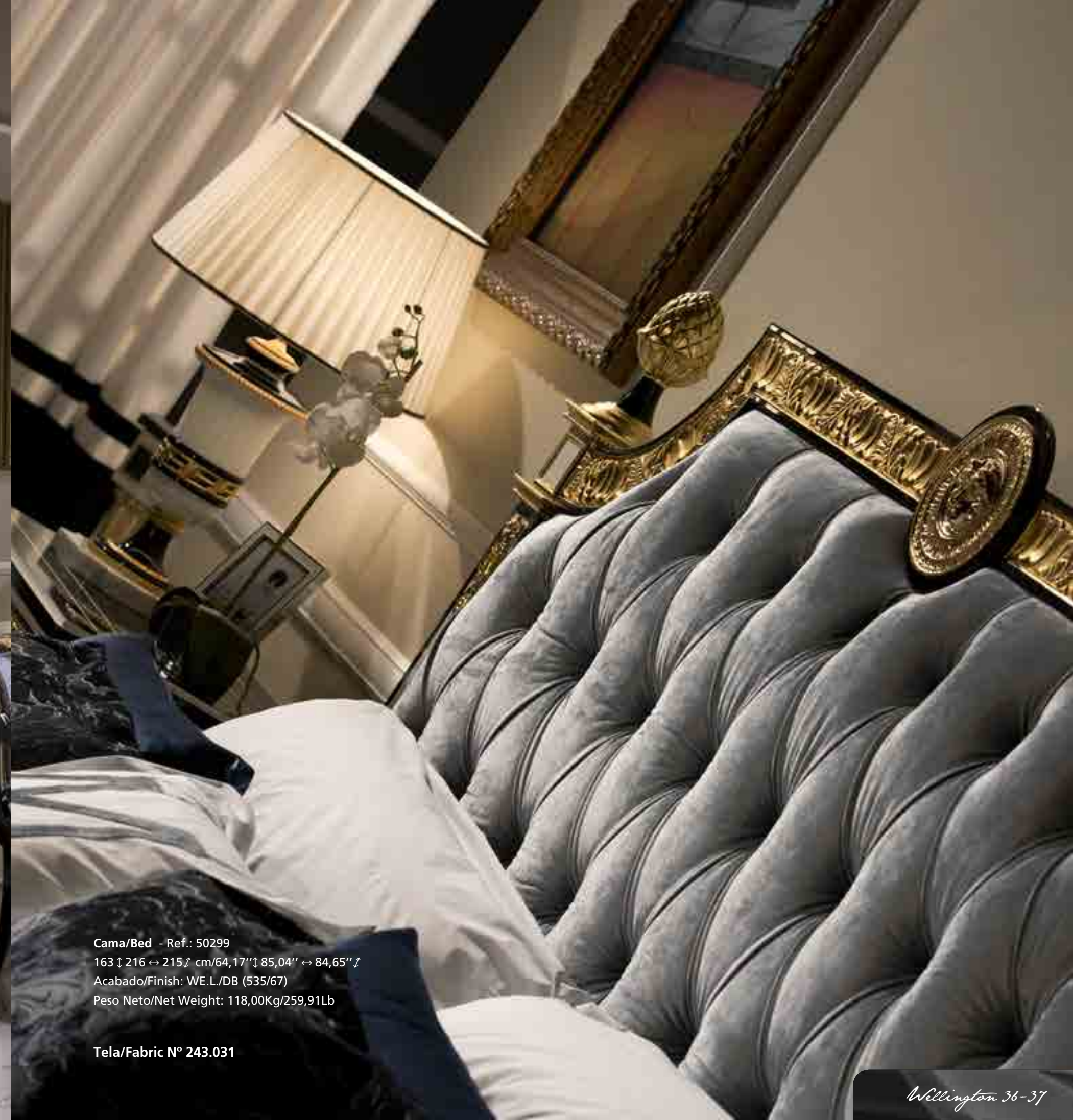
Cama/Bed - Ref.: 50299 163 ↑ 216 ↔ 215 ↗ cm/64,17" ↑ 85,04" ↔ 84,65" ↗ Acabado/Finish: WE.L./DB (535/67) Peso Neto/Net Weight: 118,00Kg/259,91Lb