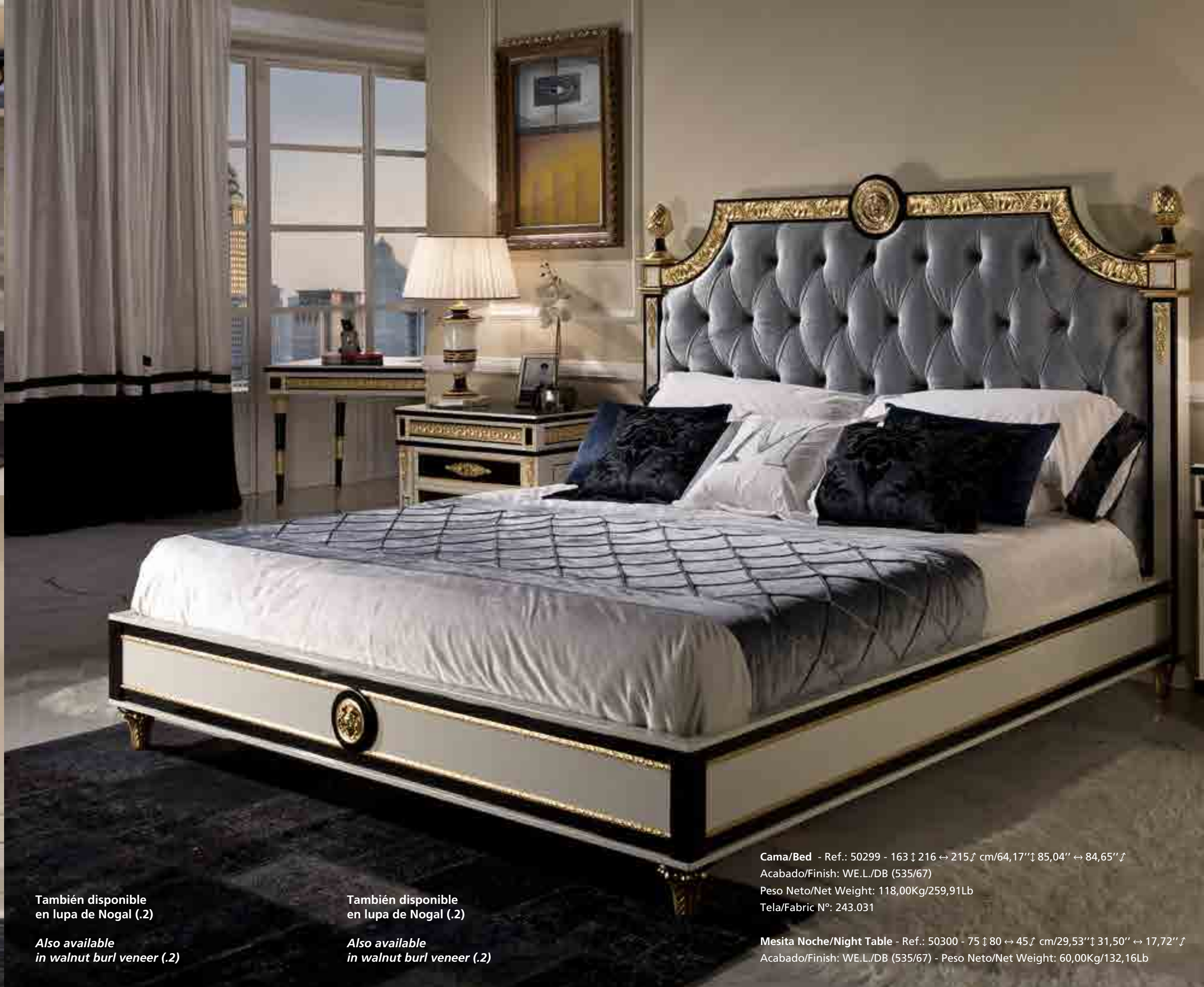
Cama/Bed - Ref.: 50299 - 163 ↓ 216 ↔ 215 ↑ cm/64,17" ↓ 85,04" ↔ 84,65" ↑ Acabado/Finish: WE.L./DB (535/67) Peso Neto/Net Weight: 118,00Kg/259,91Lb Tela/Fabric N°: 243.031

También disponible en lupa de Nogal (.2)