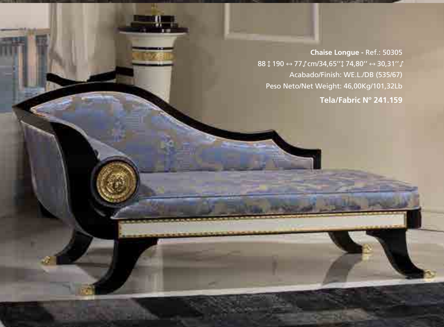
Chaise Longue - Ref.: 50305 88 ↓ 190 ↔ 77 ↑ cm/34,65" ↓ 74,80" ↔ 30,31" ↑ Acabado/Finish: WE.L./DB (535/67) Peso Neto/Net Weight: 46,00Kg/101,32Lb Tela/Fabric N° 241.159