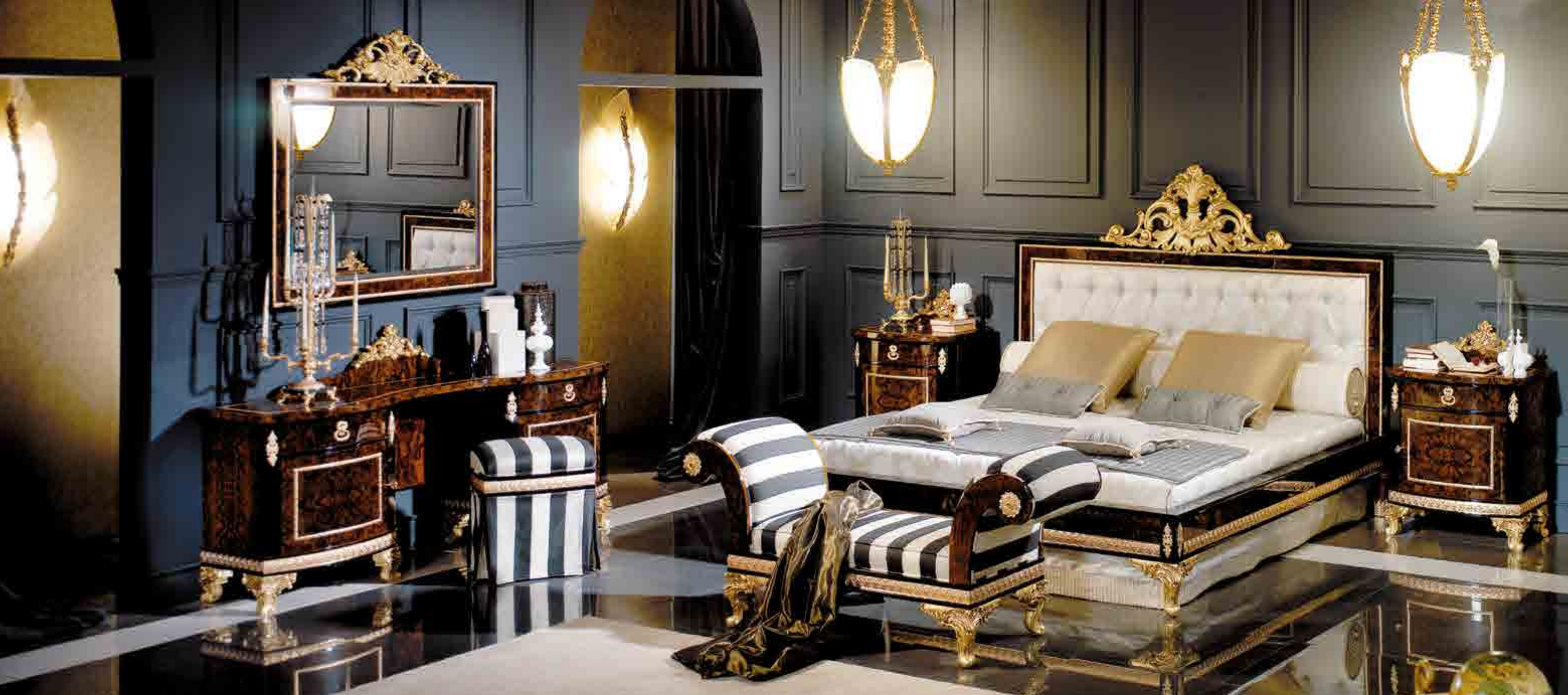
Cama/Bed (Tela Nula/Discontinued Fabric)

Tela Sugerida/Suggested Fabric N°241.060