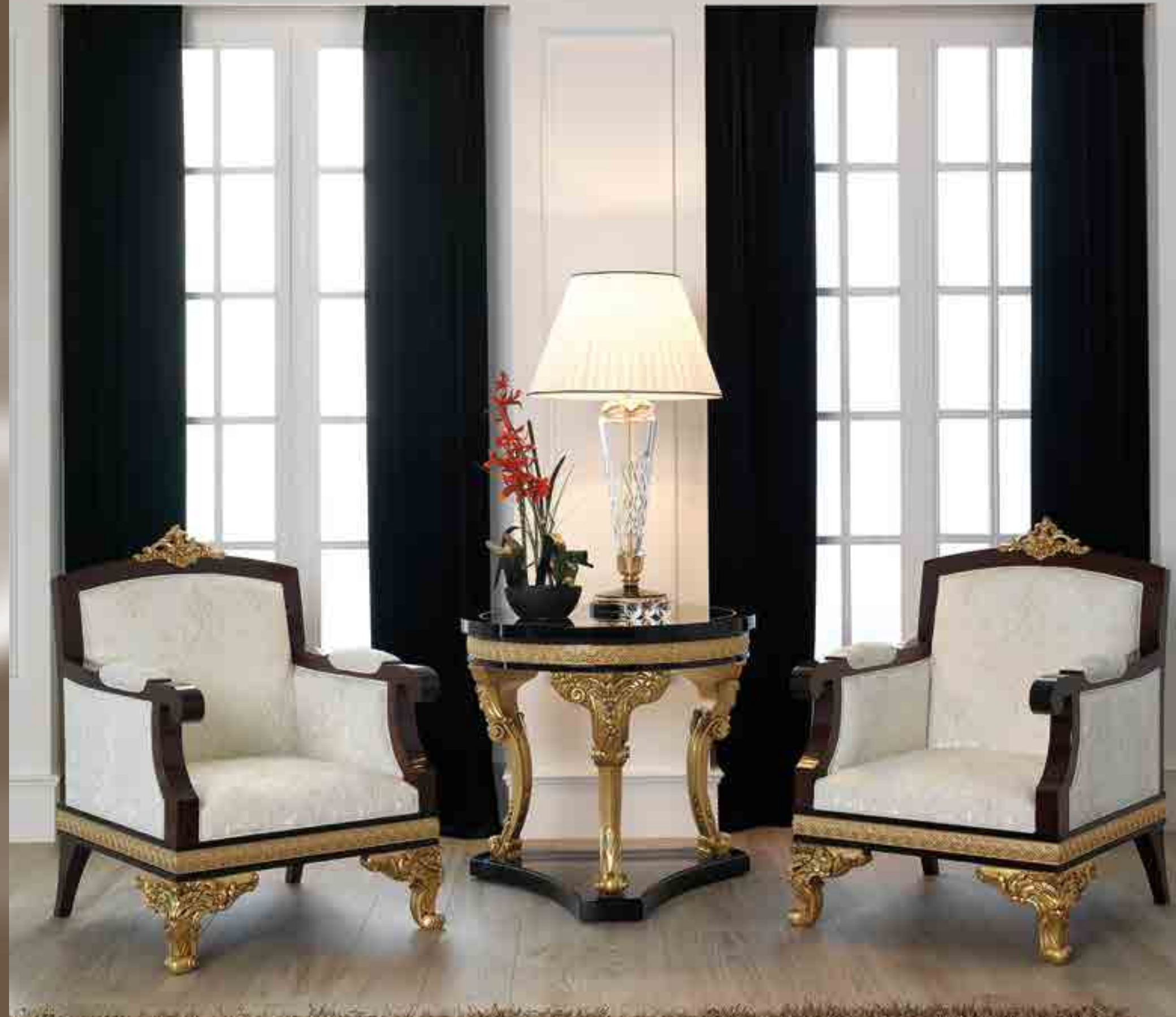
Easy Chair - Ref.: 50178 101↑ 72↔ 78↓ cm-39,76"↑ 28,35"↔ 30,71"↓ Acabado/Finish: NO.POE/OA (435/231) Tela/Fabric N°241.110 Peso Neto/Net Weight: 25,00Kg/55,07Lb