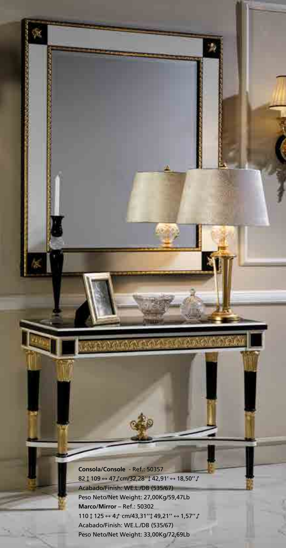
Consola/Console - Ref.: 50357 82 ↑ 109 ↔ 47 ↗ cm/32,28" ↑ 42,91" ↔ 18,50" ↗ Acabado/Finish: WE.L./DB (535/67) Peso Neto/Net Weight: 27,00Kg/59,47Lb Marco/Mirror - Ref.: 50302 110 ↑ 125 ↔ 4 ↗ cm/43,31" ↑ 49,21" ↔ 1,57" ↗ Acabado/Finish: WE.L./DB (535/67) Peso Neto/Net Weight: 33,00Kg/72,69Lb