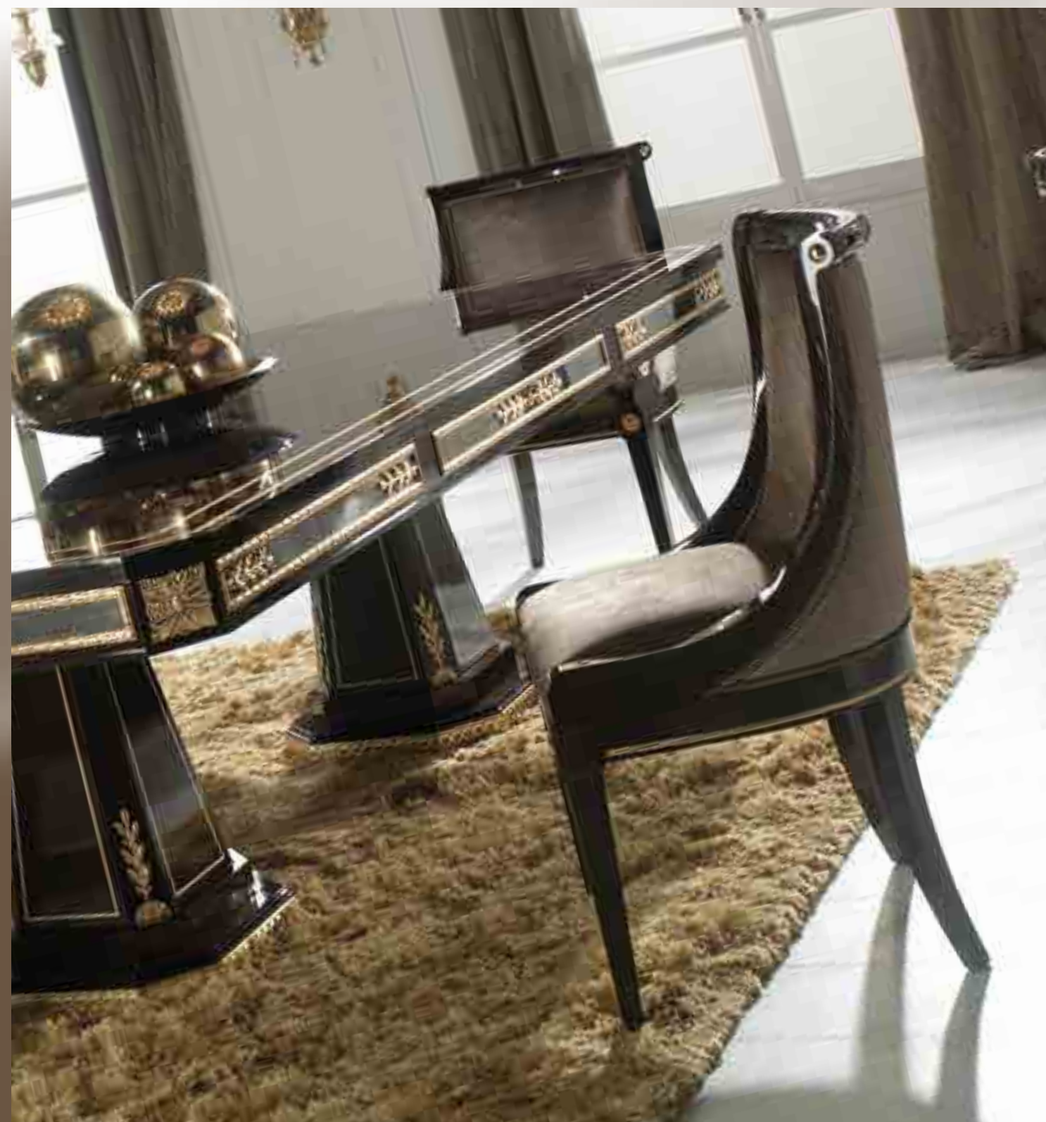
Silla/Chair - Ref.: 50092 95 ↑ 59 ↔ 58cm - 37,40" ↑ 23,23" ↔ 22,83" Acabado/Finish: N.A.B./DB (515/67) Peso neto/Net Weight: 12,00Kg/26,43lb

Tela Nula / Discontinued Fabric Tela Sugerida/Suggested Fabric N° 243.012