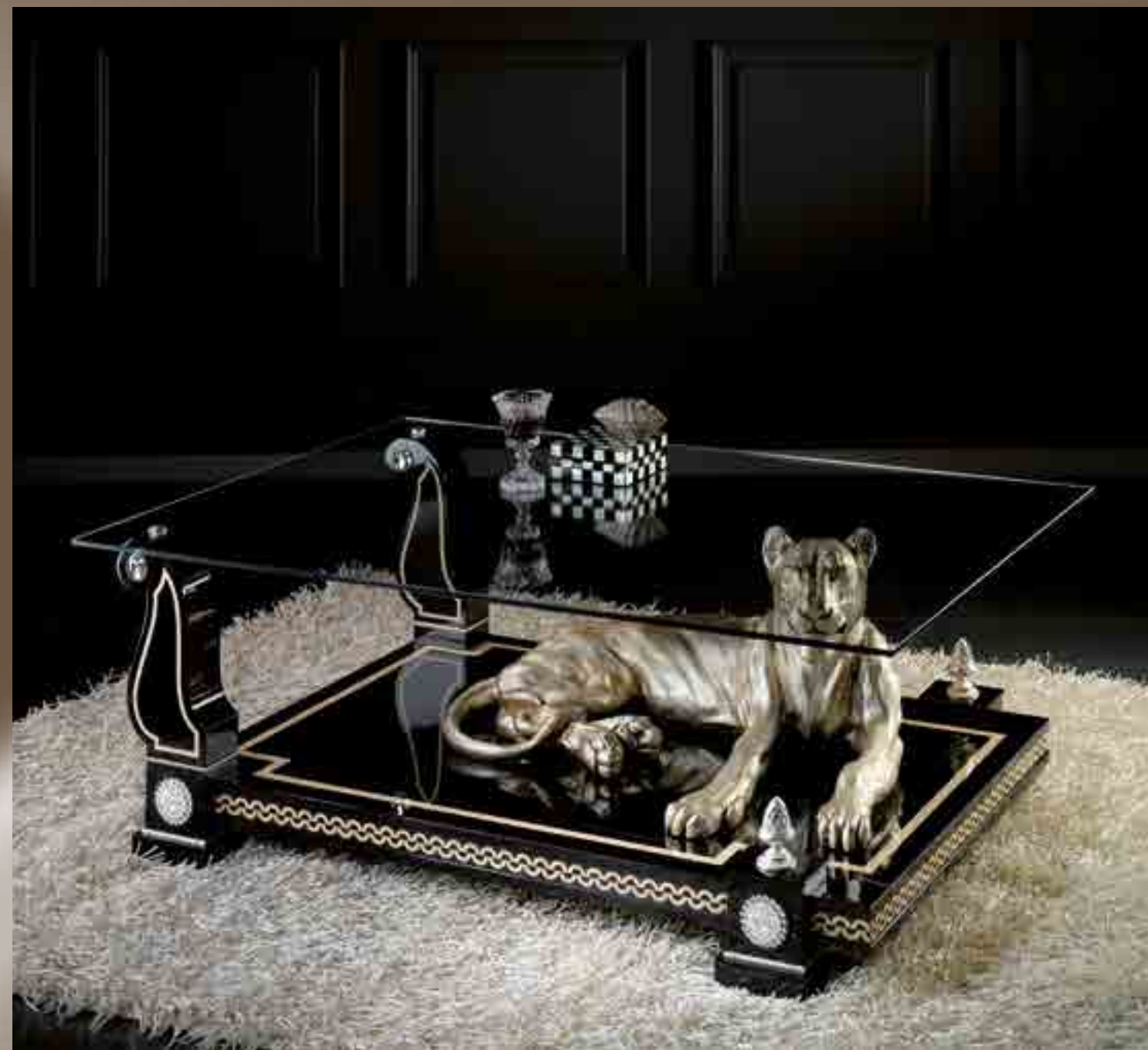
Mesa Centro/Coffee Table - Ref.: 2433 49↑ 140↔ 95↓cm - 19,29"↑ 55,12"↔ 37,40"↓ Acabado/Finish: N/PL.ANT (66/387) - Peso neto/Net Weight: 118,00Kg/259,91Lb

Tambien disponible en lupa de Nogal (.2) Also available in walnut burl veneer (.2)