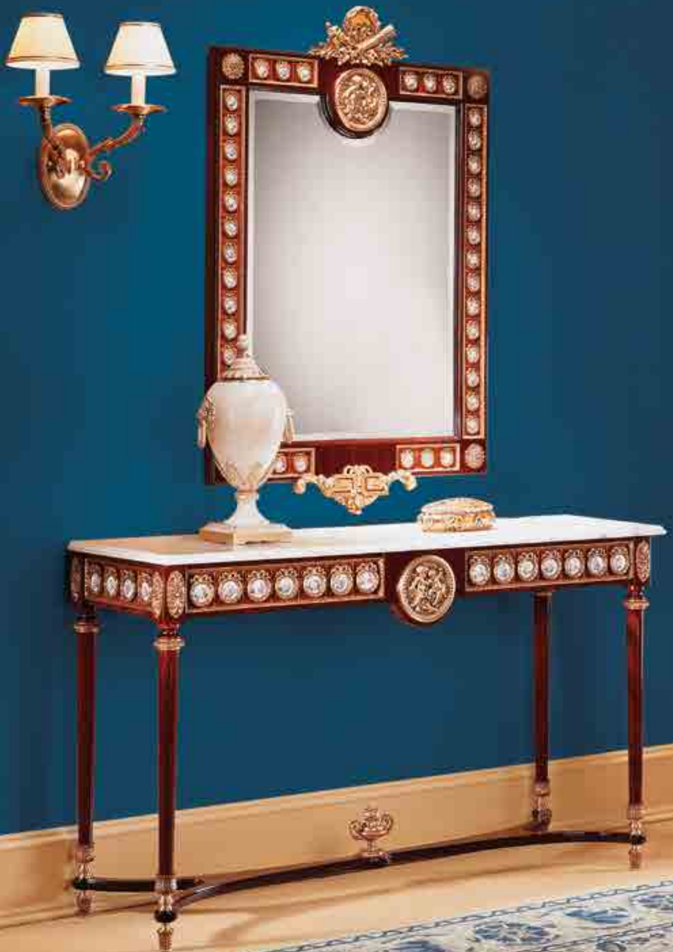
Marco/Mirror Ref.: 457 119,79↔7,7cm 46,85"↔131,10"↔2,76" ↗ Acabado/Finish: CC/OF (18/55) Peso neto/Net Weight: 36,00Kg/79,30Lb