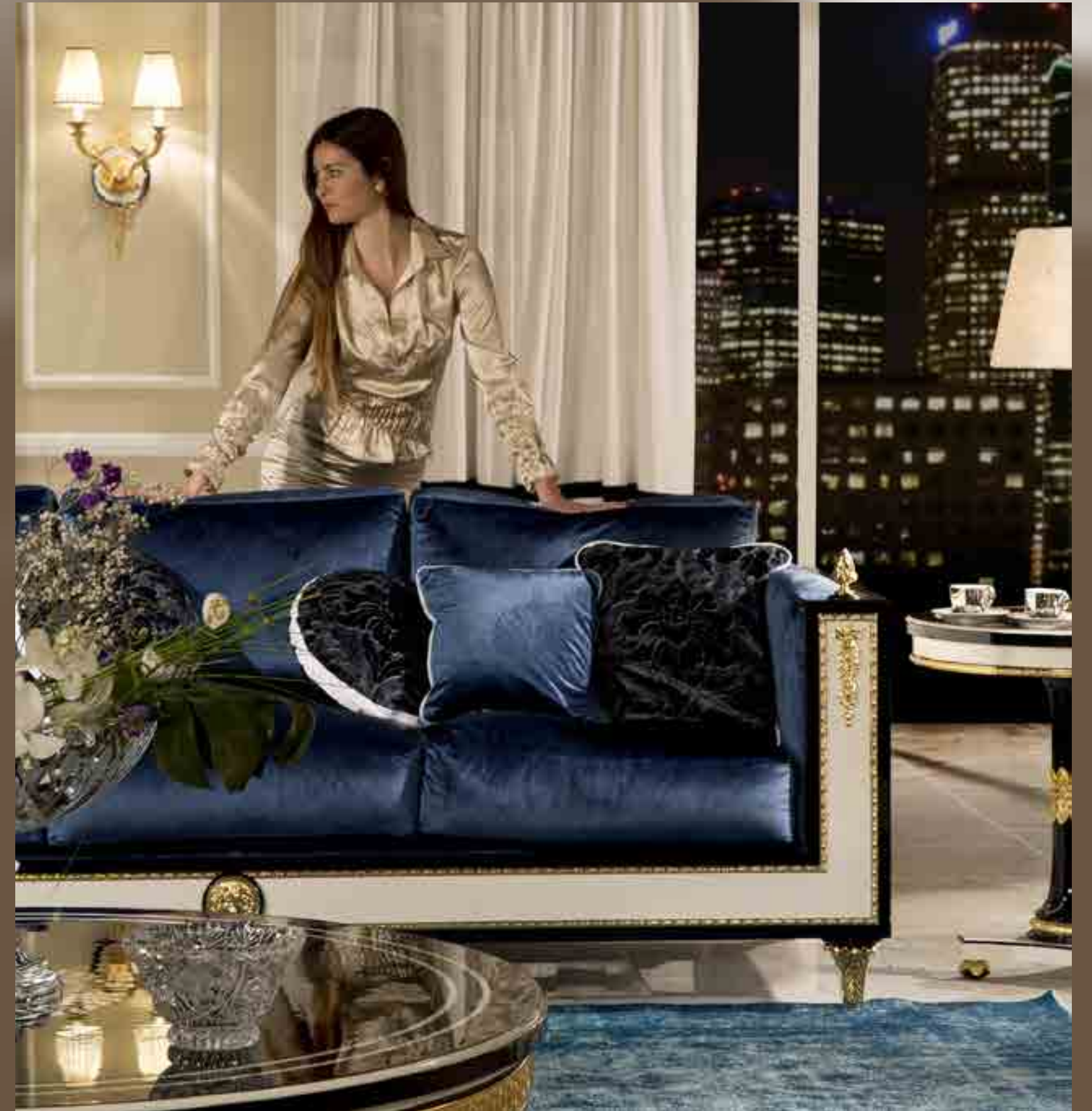
Mesa Centro/Coffee Table - Ref.: 50295 - 50 ↑ 130 ↔ 130 cm/19,69" ↑ 51,18' ↔ 51,18" - Acabado/Finish: WE.L./DB (535/67)- Peso Neto/Net Weight: 55,00Kg/121,15Lb